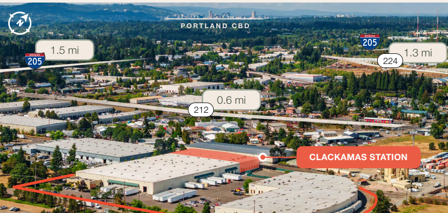
2024 PacTrust. All information supplied herein, including but not limited to measurements dimensions, and specifications, is deemed reliable but is not guaranteed and should be independently verified. Any reliance on the information contained herein is at the user's own risk.